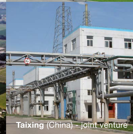
Taixing (China) - joint venture