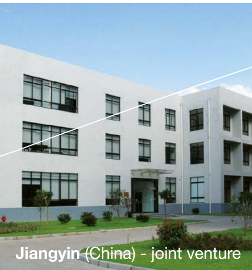
Jiangyin (China) - joint venture