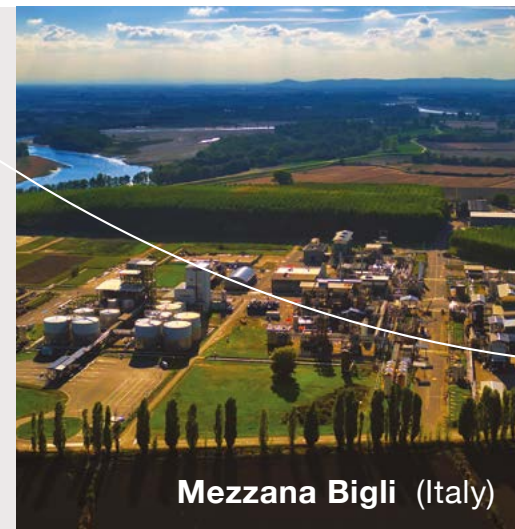
Mezzana Bigli (Italy)

Our quality laboratory monitors the entire production process on a daily basis, checking for impurities in active ingredients and finished products, and checking for and preventing cross-contamination. It also works in contact with the environmental laboratory which monitors the effects of the factories' activities on the local area, examining waste water, quantifying emissions and carrying out abatement tests on new active ingredients.