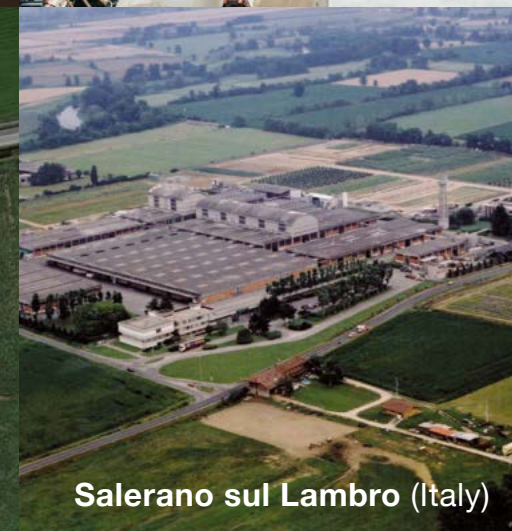
Salerano sul Lambro (Italy)